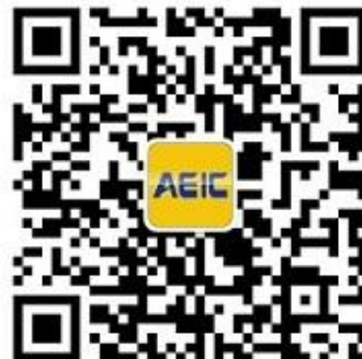
AEIC Official WeChat